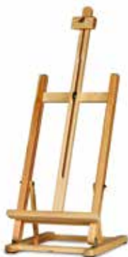
TABLE BOX EASEL CALLISTO

Solid pinewood table easel. For optimal work this easel has a centre pole with a canvas carrier that can be adjusted in height and angle. Thanks to the foldable base the easel is easy to store.