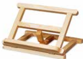
TABLE EASEL LEDA

Foldable pinewood table easel (bookend model). Practical to use and easy to store.