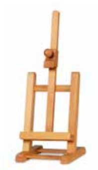
TABLE EASEL ELARA

Very compact beechwood table easel with slanted struts. Suitable for working on smaller canvases. Equipped with a canvas clamp for extra canvas stability.