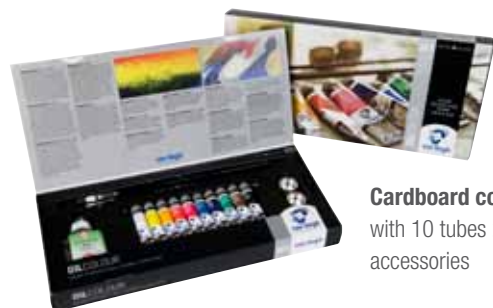
Cardboard combi set with 10 tubes 20 ml and accessories