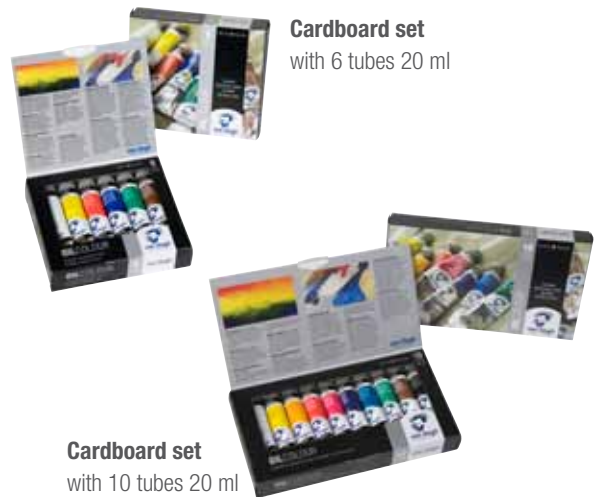
Cardboard set with 6 tubes 20 ml

In addition to a wide range of separate tubes, there are sets available with the most important basic colours, a combi set with accessories and various wooden artists' boxes. Looking for an original and creative present? Surprise someone with an oil colours set or an artists' box!